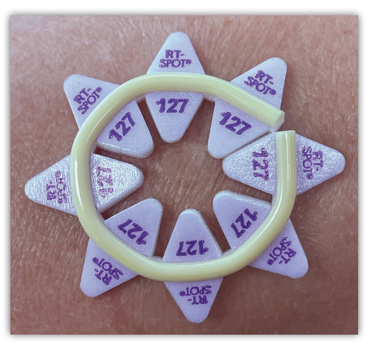
▲ The moldable backing allows RT-SPOT skin marker for CT simulation to bend into various shapes – even small circles

RT-SPOT skin marker for CT simulation is a flexible line that contours more easily into desired shapes and stays in place without lifting. Ideal for marking field borders, tangents, scars, sarcomas and larger treatment areas.