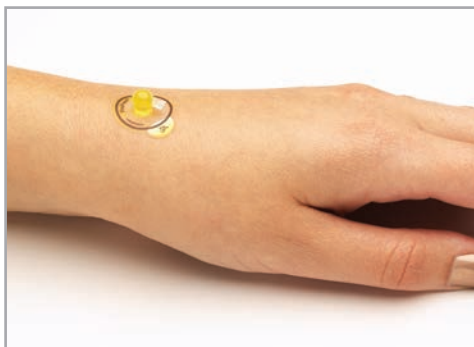
PinPoint sits on top of the adhesive label and area of interest.