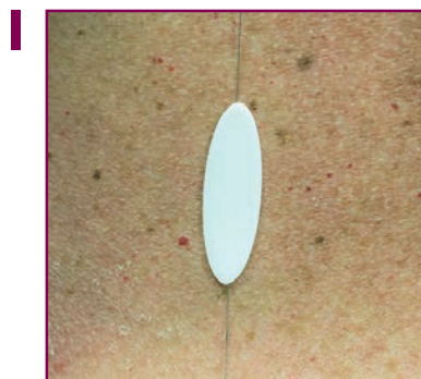
Tack down wire with oval foam tab.