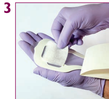
Place enclosed gauze under large square end or over wire exit site.