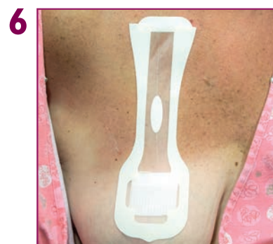
Pop out half-moon shaped tab from side of paper liner. Apply tab to the cut end to use as pick-up tab for removal later.

7 Prior to the surgical procedure, remove Cradles needle localization wire protectors by gently pulling up on either end.