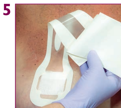
Peel off remaining paper liner and position long strip over wire. Press to apply adhesive border. If needed, cut off excess length of strip.