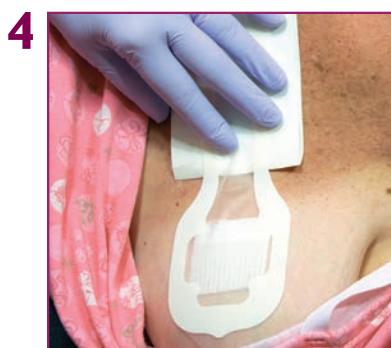
Position and adhere large square end directly over wire exit site.