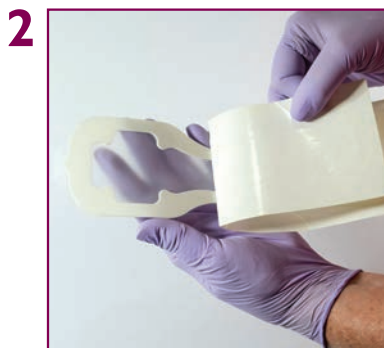
Pull paper liner away from large square end to perforated line.