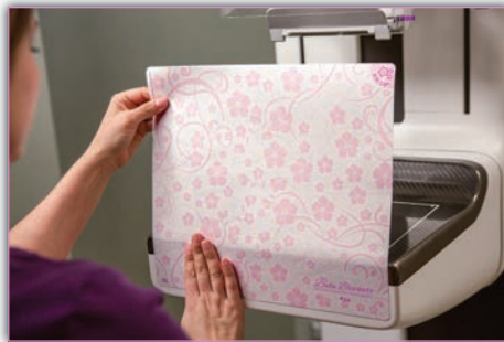
2a. Place adhesive side down and smooth by starting at the front of receptor plate while holding the top.