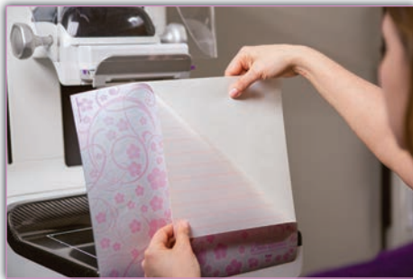
1. Remove Bella Blankets® from liner.