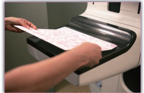
2b. Or apply by starting at the back of receptor plate then pull taut to the front.