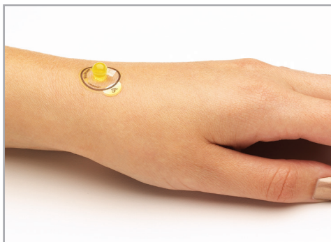
PinPoint skin marker for small field of view imaging in MRI sits on top of the adhesive label and area of interest.